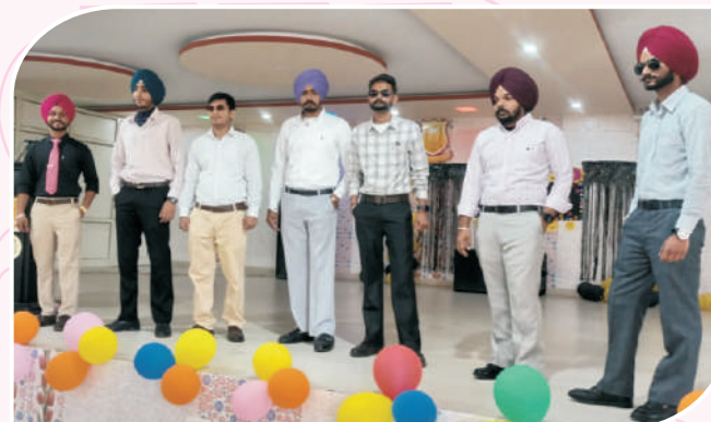
Modelling of Boys at Farewell