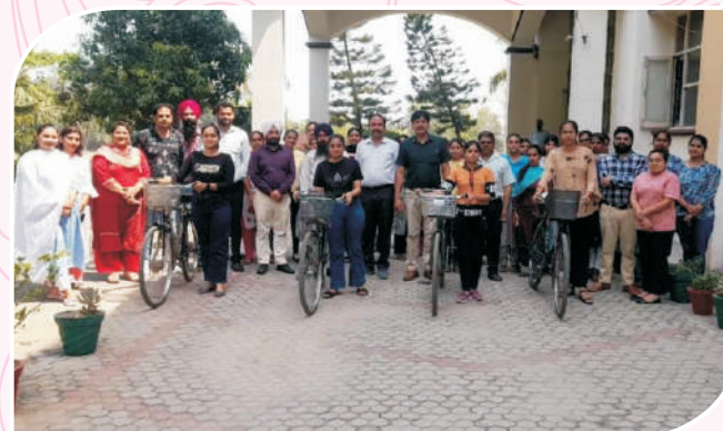
World Bicycle Day