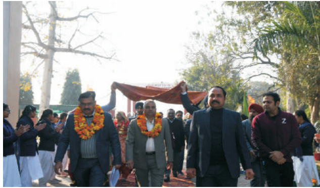
Welcome Of Naac Peer Team