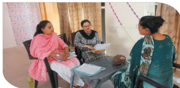
Mock Interview for Pupil Teachers