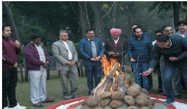
Lohri Celebration with NAAC Peer Team along with Worthy Management