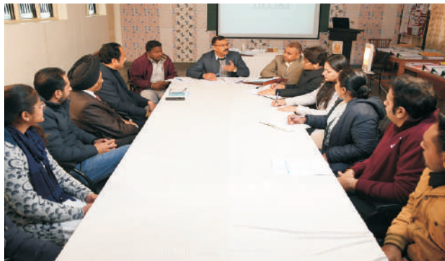
Meeting with IQAC members