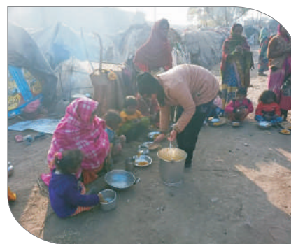
Nss Volunteers Donating Essentials At Slum Area