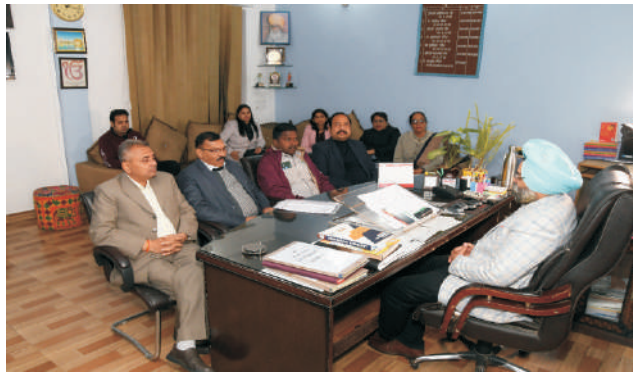
Meeting with Internship School Principal