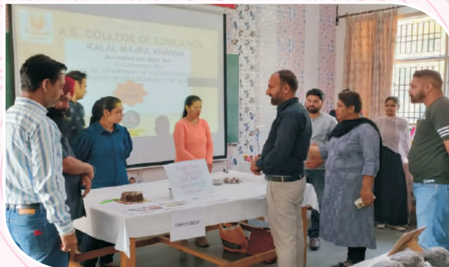
A.S. Bazaar in Collaboration with MGNCRE