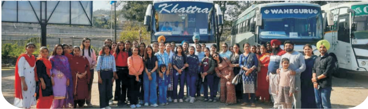
A Group Picture of Students during trip of students at Kasauli