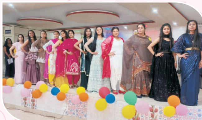
Modelling of Girls at Farewell Party