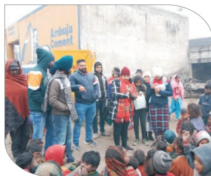
Nss Volunteers Donating Essentials At Slum Area

NSS unit of 50 students under Self Financed scheme exist in the college. Every effort is made to instill and promote the spirit of social service, patriotism and national integration among the students.