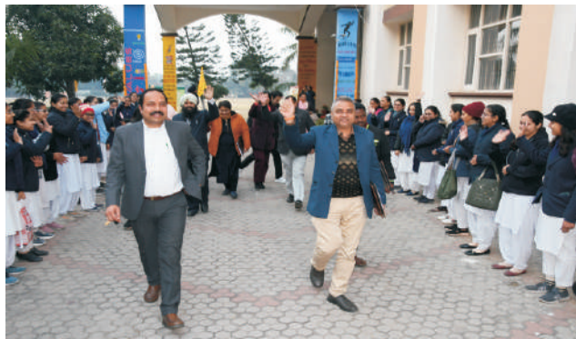
NAAC Peer Team Exit