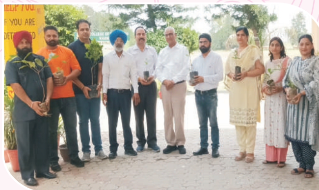
Tree Plantation on World Environment Day