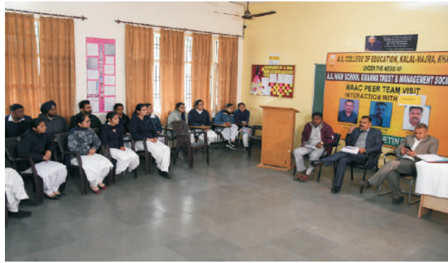
Meeting with Student Council