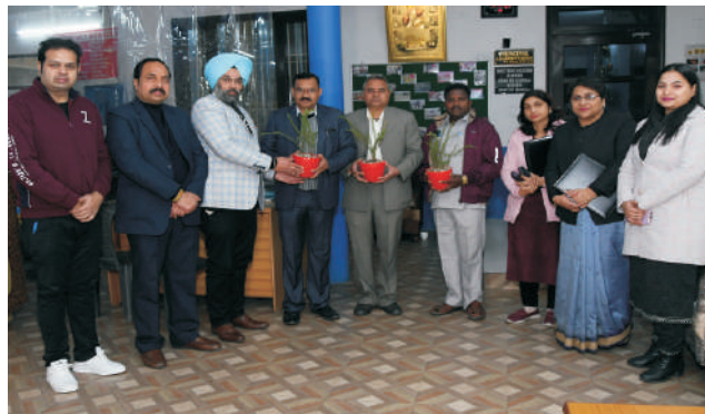
Visit to Internship School