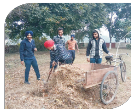
NSS Volunteers Cleaning the College Play Ground