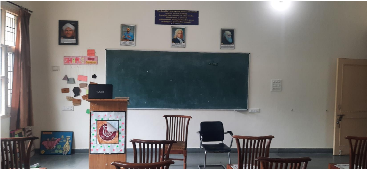
Room = 7